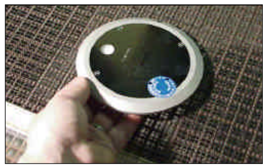
Place DISKURE 365 on conveyor with sensor facing UV light source.