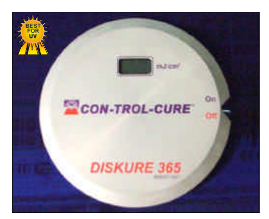
CON-TROL-CURE® DISKURE 365 radiometer