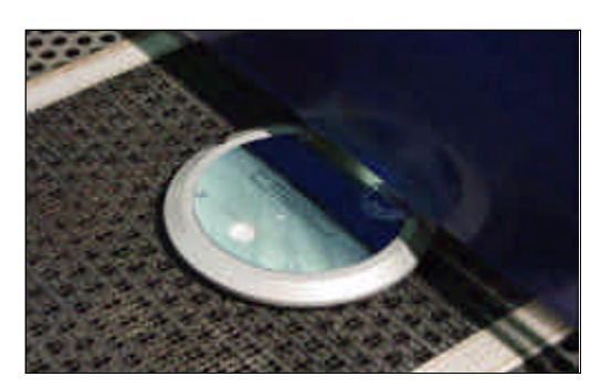
Pass the DISKURE 365 through your curing chamber at same speed your product is being cured to receive an accurate measurement of curing energy.

The CON-TROL-CURE® DISKURE 365 radiometer is a self-contained UV dose measuring instrument small enough (5.5" diameter x .5" height) for use in most UV curing ovens. A sensor on one side is exposed to the radiation and the other side contains a digital LCD which displays direct energy readings in millijoules per cm².